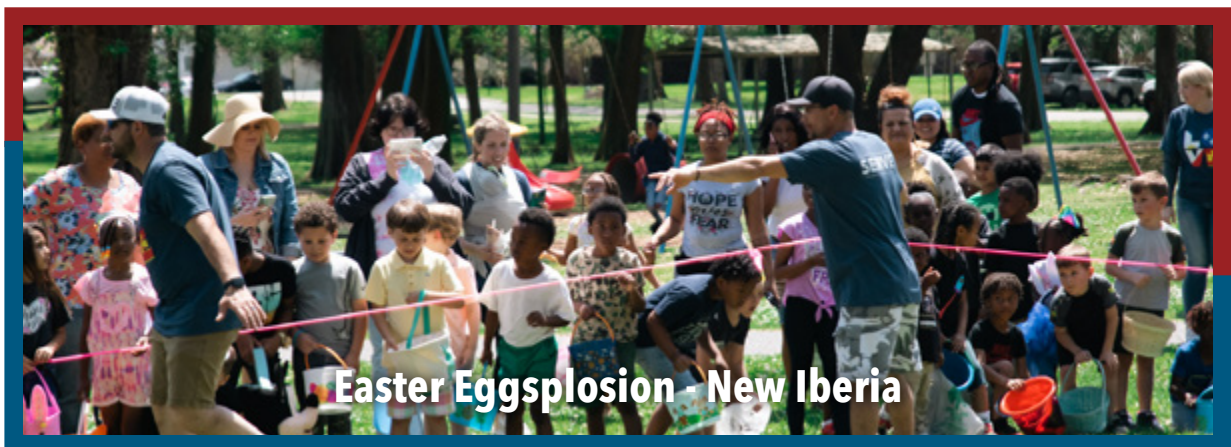
Easter Eggspllosion - New Iberia

Love Acadiana, OSC Broussard and the Hope Center teamed up in April to host a Family Day and Easter Egg Hunt in St. Martinville's Magnolia Park. The event drew over 60 volunteers and 150 children and their families to hunt 10,000 eggs! They also enjoyed cornhole, Kan Jam, rock painting, and refreshments from Raising Cane's Chicken Fingers. The best part was the relationships formed, connections made and invitations to celebrate Jesus, the real reason for the Easter season.