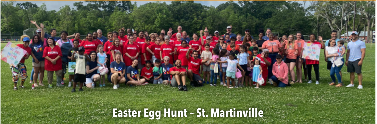
Easter Egg Hunt - St. Martinville

Love Acadiana, OSC Broussard and the Hope Center teamed up in April to host a Family Day and Easter Egg Hunt in St. Martinville's Magnolia Park. The event drew over 60 volunteers and 150 children and their families to hunt 10,000 eggs! They also enjoyed cornhole, Kan Jam, rock painting, and refreshments from Raising Cane's Chicken Fingers. The best part was the relationships formed, connections made and invitations to celebrate Jesus, the real reason for the Easter season.